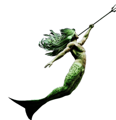
Merman by shd-stock shd-stock on deviantArt - CC BY 3.0

HD: 8d AC: 18 Armed with pincers (damage: 1d6)