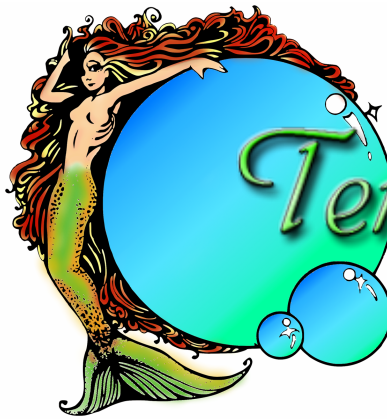
Mermaid by liftarn Openclipart - CC0 1.0