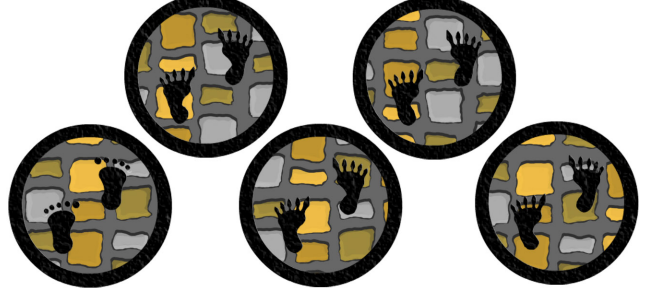
Party and Encounter tokens