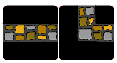
Spare tiles to replace Y sections when using multiple sets.

Print out the map on card stock, then cut out each tile and counter. Lay out the map at random, with the start and end Y sections at opposite corners of the map. No continuous paths are needed. The tiles are your map of the action, hide them from the players view. Characters turn adjacent tiles by using a magical command word or artifact, once a tile is turned, simply rotate the tile on your map and relate the new information to the player's. Use the counters to represent the location of encounters on the map. Any tile that opens onto the edge of the map is considered closed.